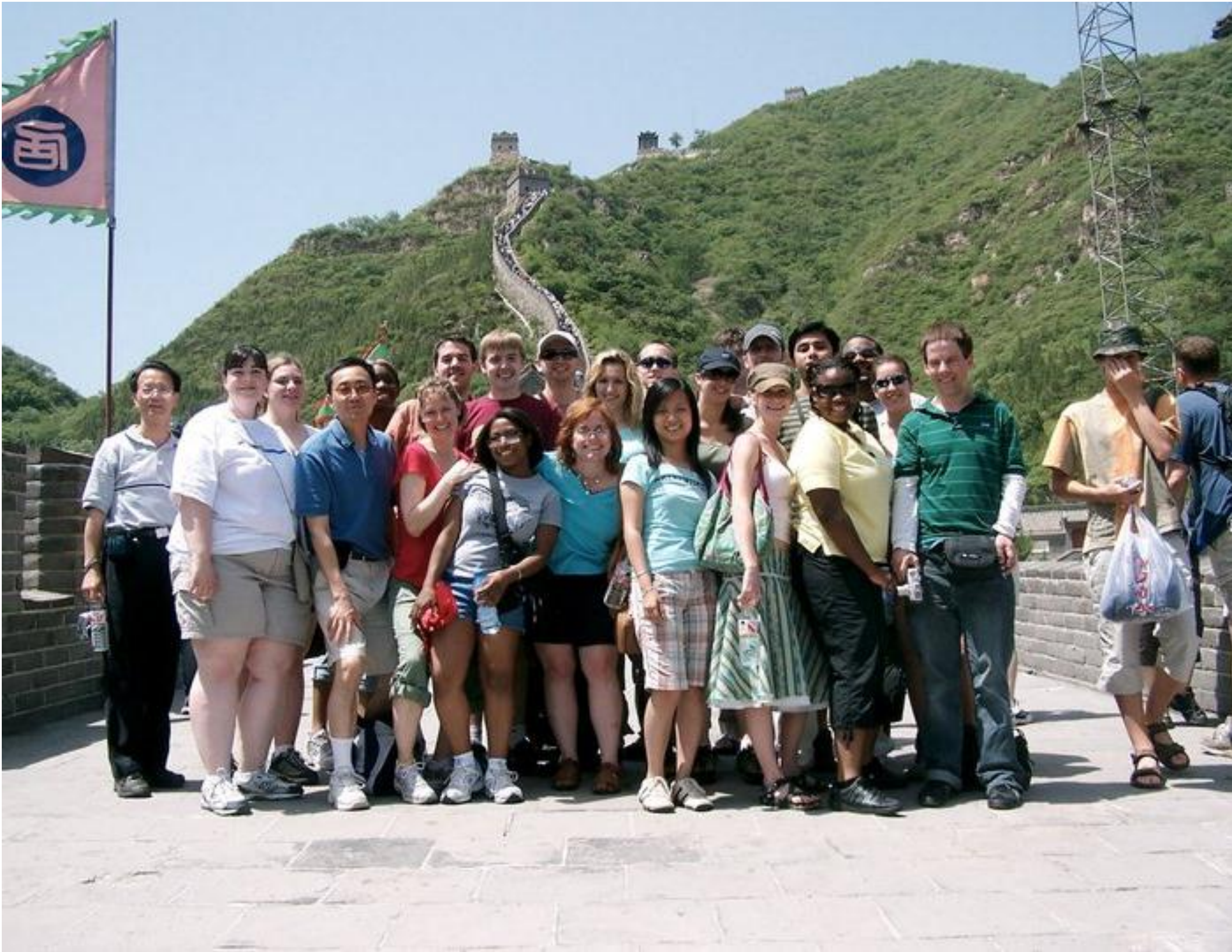
Study abroad: China Language Program