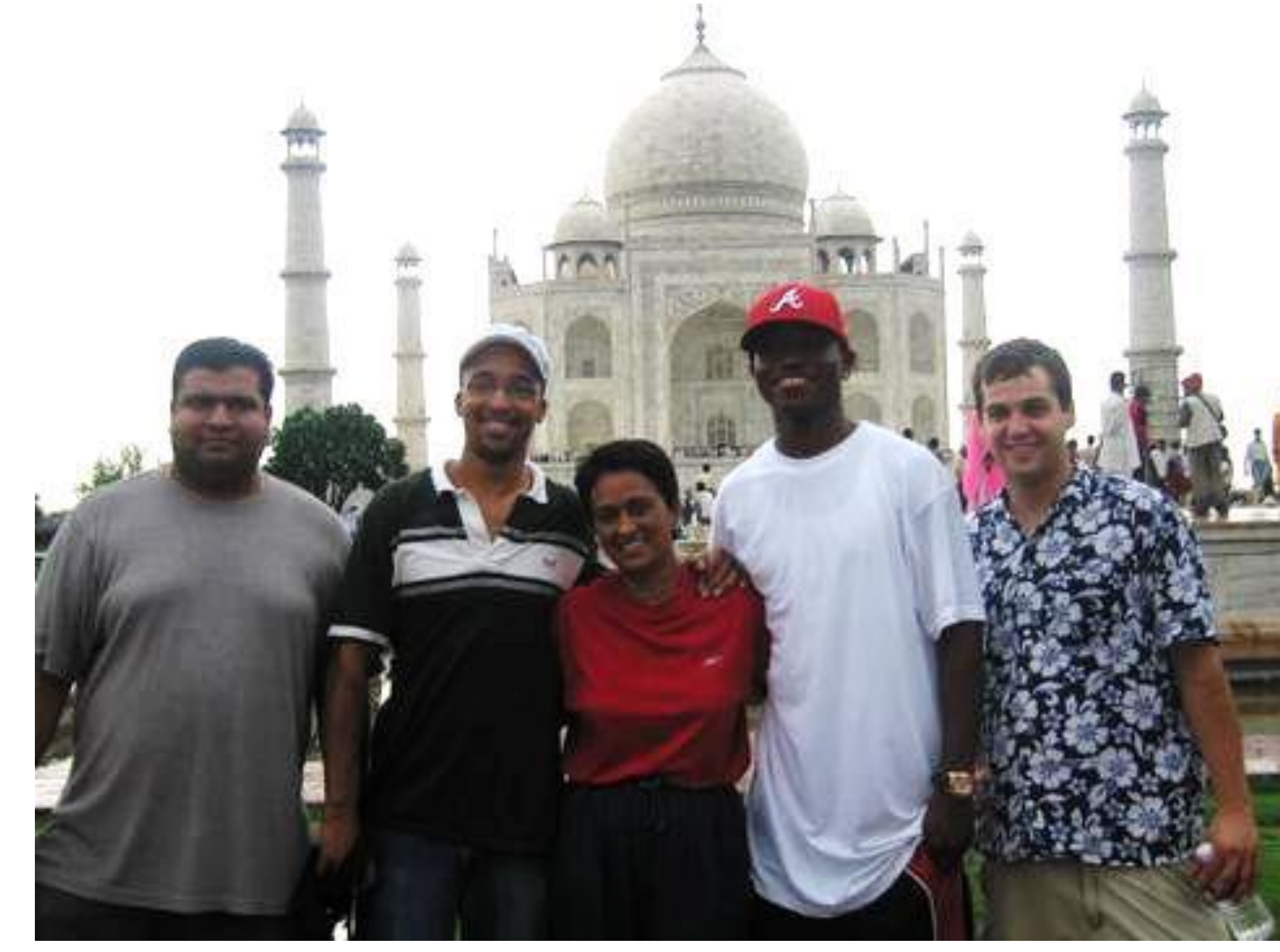
Study abroad: India Biotech Program