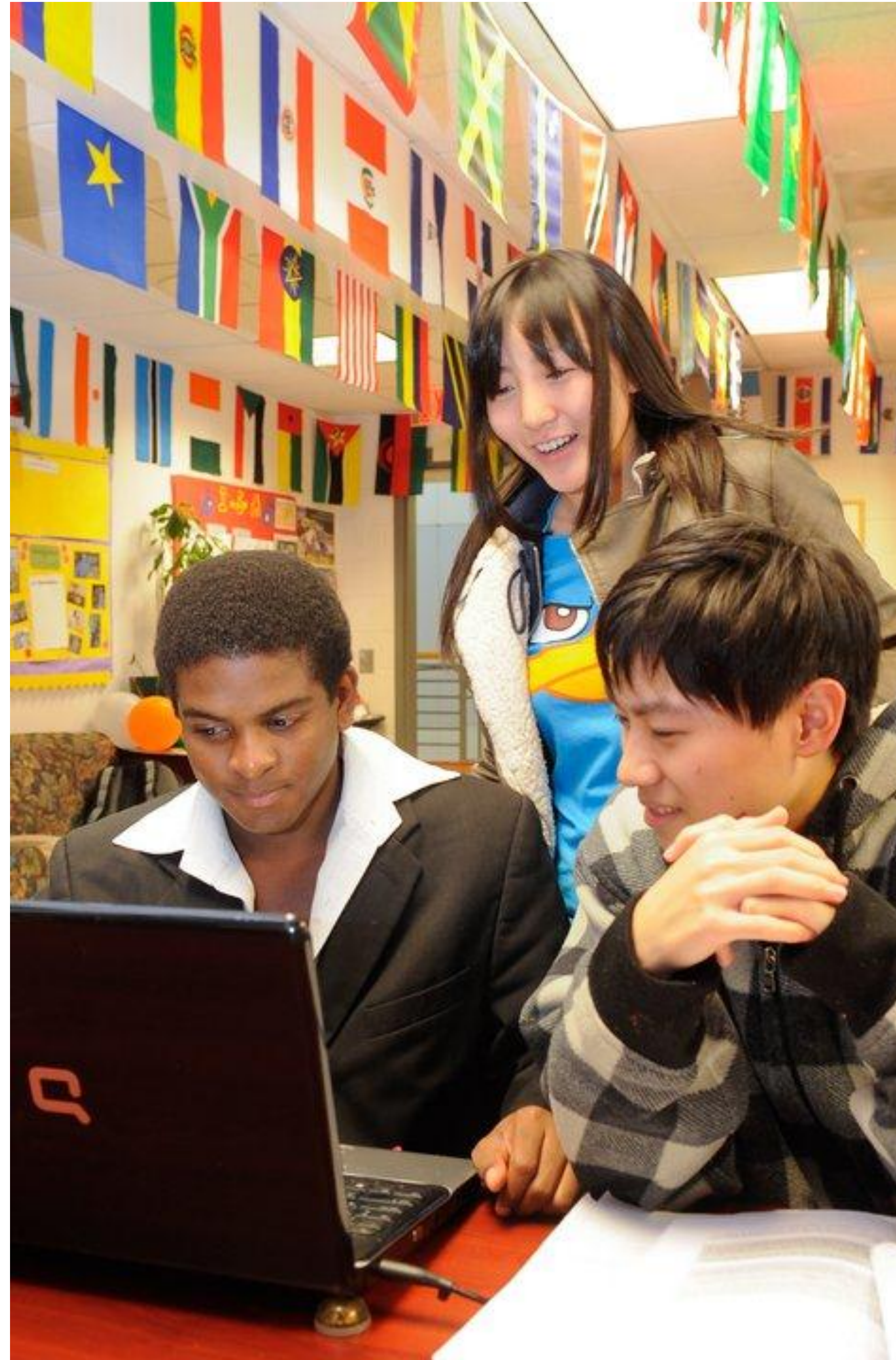
KSU's Global Village: International Student Lounge